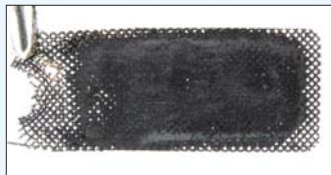
Leading Oil Brand