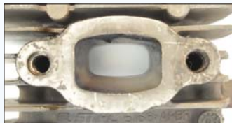
AMSOIL SABER Professional