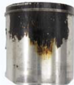
Leading Oil Brand