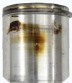
AMSOIL SABER® Professional