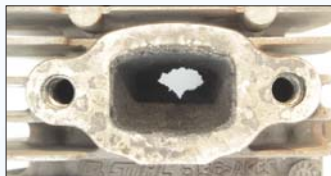
Leading Oil Brand