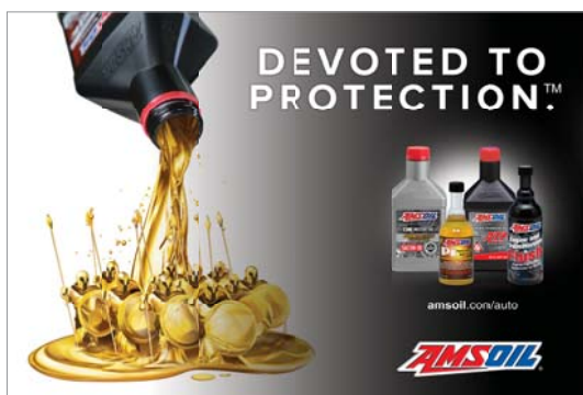
Retail Counter Mat (G3351)