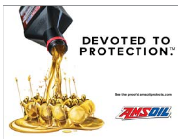
Window Decal 9"x12" (G3356)