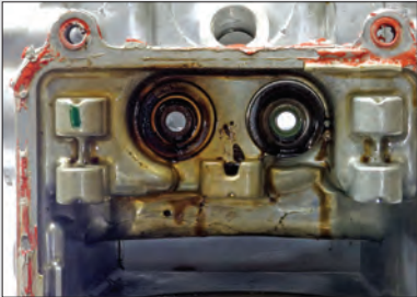
AMSOIL 10W-30 Synthetic Small Engine Oil 125 Hours

Following 125 hours of severe-service testing in a Honda® 5-hp engine, 10W-30 Synthetic Small Engine Oil kept the valve guides in the engine pictured on top clean and functional. In contrast, using a leading oil brand, the engine pictured on bottom failed due to exhaust valve sticking. During engine disassembly, heavy deposits prevented test administrators from removing the valve.