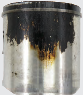
Leading Oil Brand 300 Hours