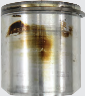
AMSOIL SABER Professional 300 Hours

Following 300 hours of professional-use testing in STIHL® string trimmers at the manufacturer mix ratio of 50:1, SABER Professional kept pistons and rings virtually free of carbon and wear (see the picture on the top), while use of a leading oil brand caused significant carbon buildup around the ring area (see the picture on the bottom). This engine is nearing the failure point.