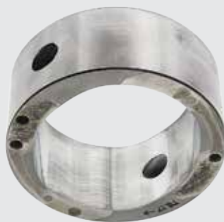
VANE PUMP CAM RING

Order by Phone 1-800-956-5695 - Give Operator Reference #5040721