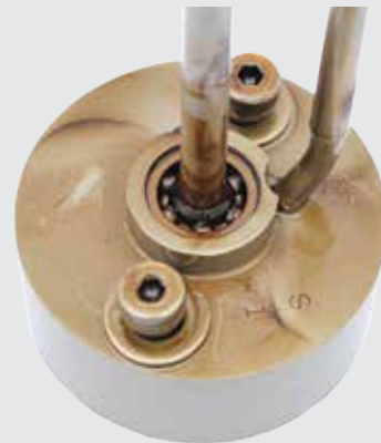
AMSOIL SYNTHETIC MULTI-VISCOSITY HYDRAULIC OIL (ISO 46)