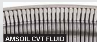
AMSOIL CVT FLUID