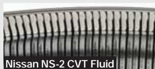
Nissan NS-2 CVT Fluid